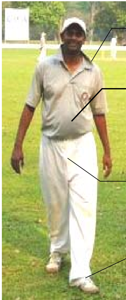
On The Field