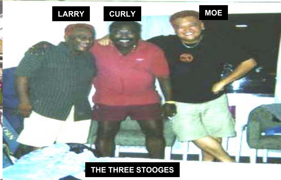
THE THREE STOOGES

"FLY ME TO THE MOON." "I'M LEAVING ON A JET PLANE....."