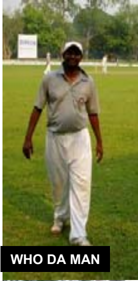
WHO DA MAN