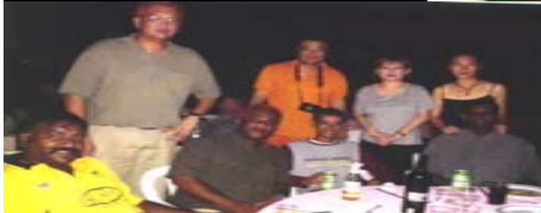
THE RUNNERS UP OF THE PLATE