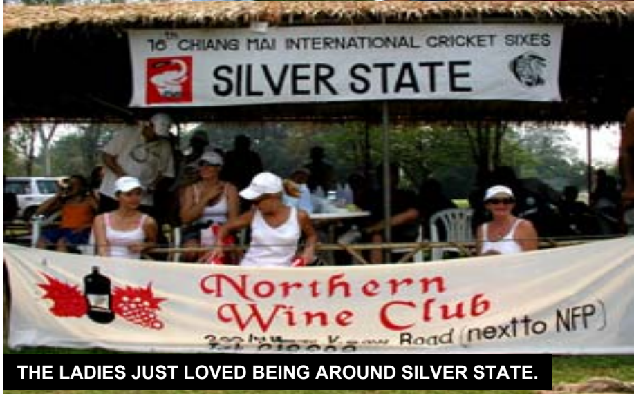
THE LADIES JUST LOVED BEING AROUND SILVER STATE.