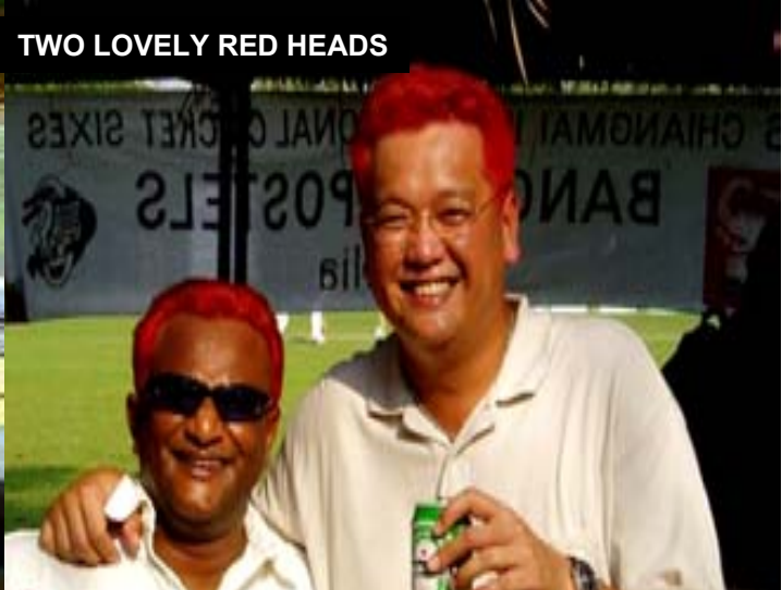
TWO LOVELY RED HEADS