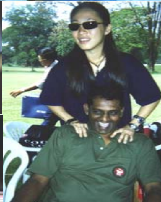
TEAM PHYSIO GETTING US READY