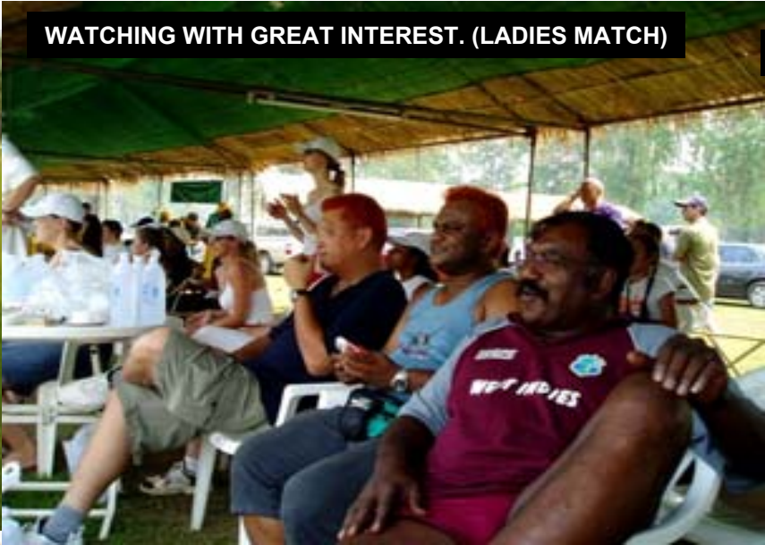
WATCHING WITH GREAT INTEREST. (LADIES MATCH)