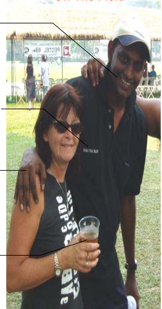
Off The Field